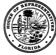
MARCO RUBIO Speaker of the House of Representatives